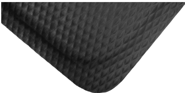
Hog Heaven with black border

Can be customized with your logo, design, or message (see Hog Heaven Impressions)